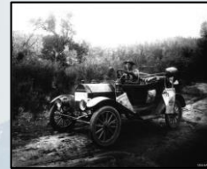
1917 Dirt Road