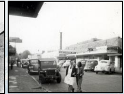
Cota Street, 1940's

Please feel free to call or email me with any additional questions.