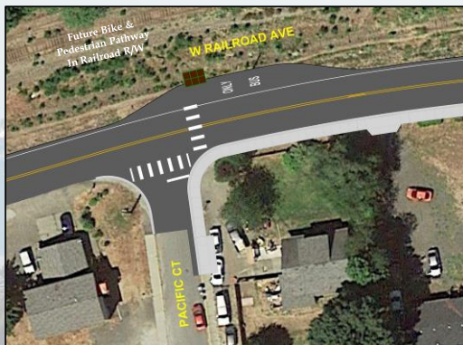
PACIFIC COURT BUS PULLOUT W/ SHELTER