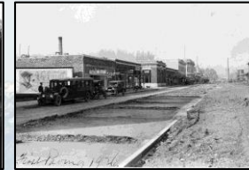
1926 First Roadway Paving